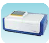
UV/VIS Spectro 2080+ Double Beam

Analytical Technologies is synonymous for offering technologies for doing analysis and is the Fastest Growing Global Brand having presence in at least 96 countries across the global. Analytical Technologies Limited is an ISO:9001 Certified Company engaged in Designing, Manufacturing, Marketing & providing Services for the Analytical, Chromatography, Spectroscopy, Bio Technology, Bio Medical, Clinical Diagnostics, Material Science & General Laboratory Instrumentation. Analytical Technologies, India has across the Country operations with at least 4 Regional Offices, 6 Branch Offices & Service Centers. Distributors & Channel partners worldwide.